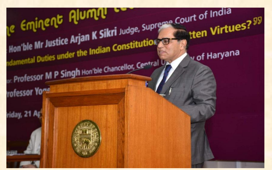
The Hon'ble Mr Justice Arjan K Sikri delivers Percipience 2